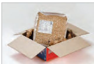
Box of 1x10 kg