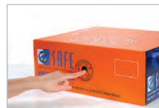
EASY VACUUM packaging control