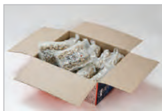
Box of 10x1 kg