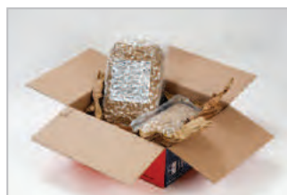
Box of 2x5 kg