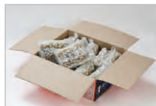
Box of 10x1 kg