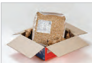
Box of 1x10 kg