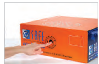
EASY VACUUM packaging control