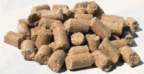
Not contractual picture