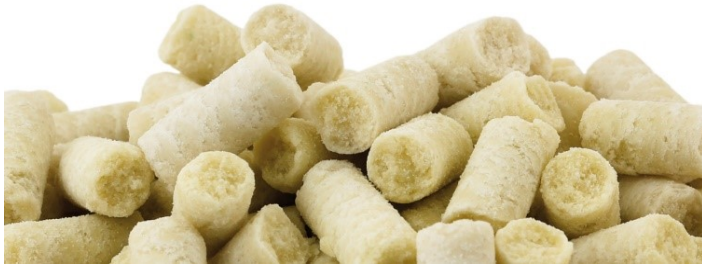
SAFE® U8958 Version 275