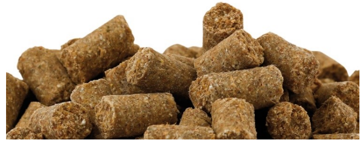
SAFE ® E8200 Version 16